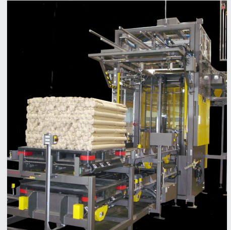
Bag depalletizer less partial pallet removal area and empty pallet stacker or magazine. This machine depicts a smaller footprint.

Contact our experienced sales teams today for a comprehensive review of your application(s) and to see how our Automatic Can Lid Depalletizer can benefit your company.