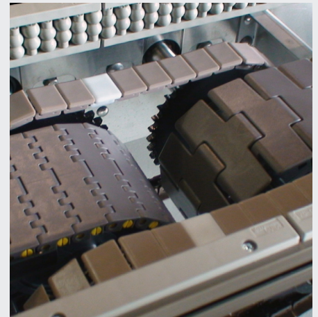
Live "straddle" transfers (optional)

For our European office, contact: Plumtree Farm Industrial Estate, Bircotes, Doncaster South Yorkshire DN11 8EW ENGLAND t. +44 (0) 1302 711056