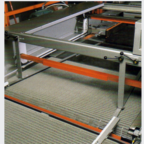
Push Bar Assembly

For our European office, contact: Plumtree Farm Industrial Estate, Bircotes, Doncaster South Yorkshire DN11 8EW ENGLAND t. +44 (0) 1302 711056