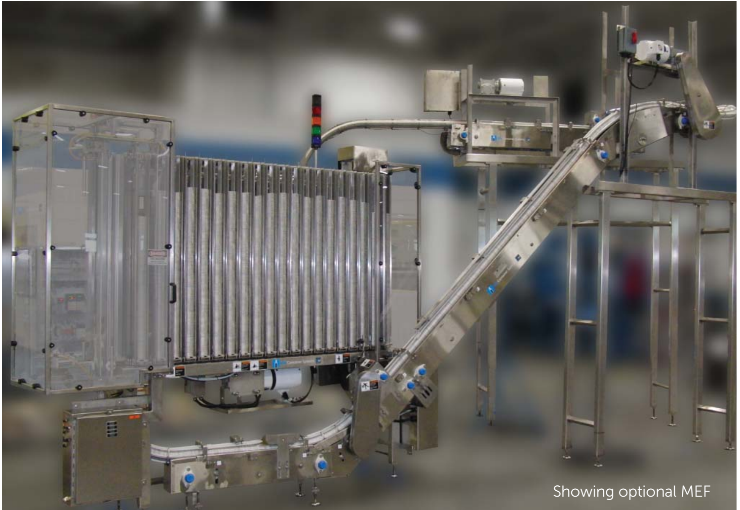
Showing optional MEF