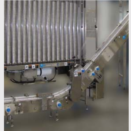
Motorized End Feeder (MEF)

Contact our experienced sales teams today for a comprehensive review of your application(s) and to see how our Rotofeeder Semi-Automatic Lid Feeding System can benefit your company.