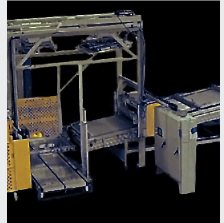
Machine shown is for PET Containers

Contact our experienced sales teams today for a comprehensive review of your application(s) and to see how our Paradigm™ Series Low Level Palletizing Systems can benefit your company.